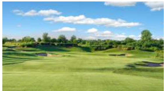
Shoal Creek Golf Course