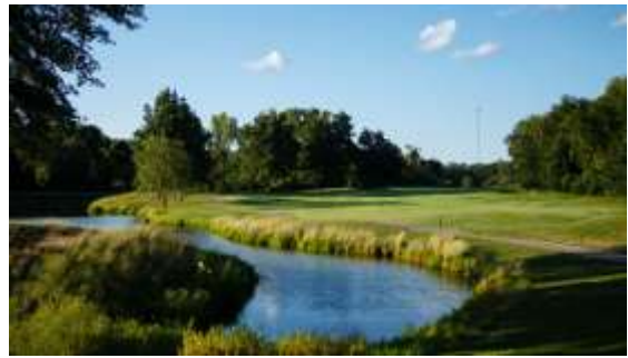
Heart Of America Golf Course

Heart of America Golf Course / Tom Watson Golf Academy offers the ultimate learning and playing opportunities in the heart of Swope Park. This facility is pure fun and recreation for anyone of any age and any skill. HOA offers three options: a beautiful regulation-length 9-hole course; a fun par-three 9-hole course; and a Tom Watson-designed junior course. HOA is home of the Tom Watson Golf Academy and also offers the best junior golf programs in Kansas City. The First Tee of Greater Kansas City, an organization that promotes the game of golf to youth in urban areas, has its offices at HOA as well. No matter where you live in Kansas City, these regulation courses provide great values that are convenient and give even the newest golfers a place to learn and play.