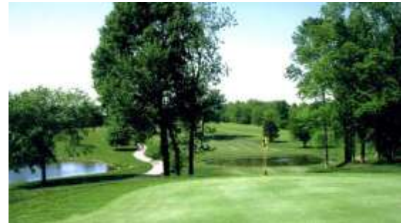
Hodge Park Golf Course