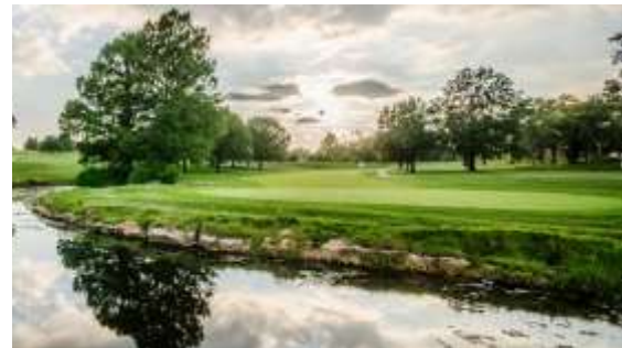
Minor Park Golf Course