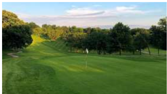
Swope Memorial Golf Course